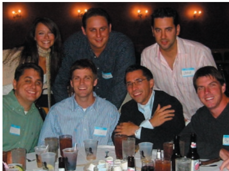
Young alumni and guests gather at the Silver Slipper as a part of Beta Eta's homecoming activities.