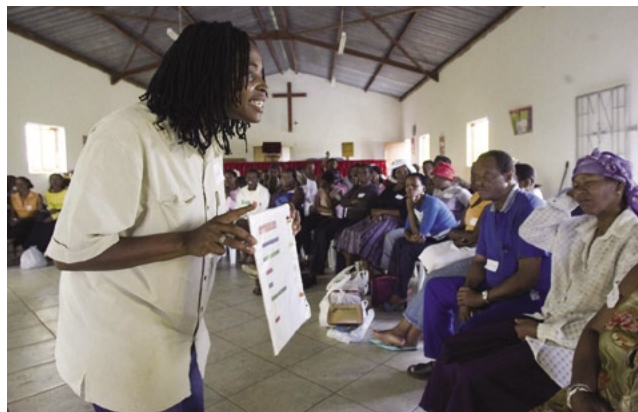
ABOVE: HIV/AIDS patients in South Africa being trained by BroadReach staff