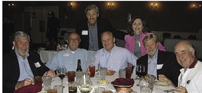
Alumni events like the one pictured here allow Beta Eta alumni to reconnect with each other and to their fraternity in a meaningful way. Hosted alumni events are also a central tenant of the BHAC's overall mission.

In addition to a successful membership drive, the BHAC also hosted several events around the Southeast on behalf of Beta Eta alumni. It sponsored game viewing parties in Tallahassee and Atlanta, a spring